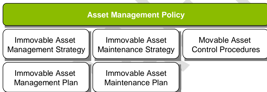
Figure 1: Proposed policy and strategic framework

The policy approach has been to firstly focus on the financial treatment of assets, which needs to be consistent across both the movable and immovable assets, and secondly to focus on the management of immovable assets as a fundamental departure point for service delivery. This arrangement is summarised in Figure 1.